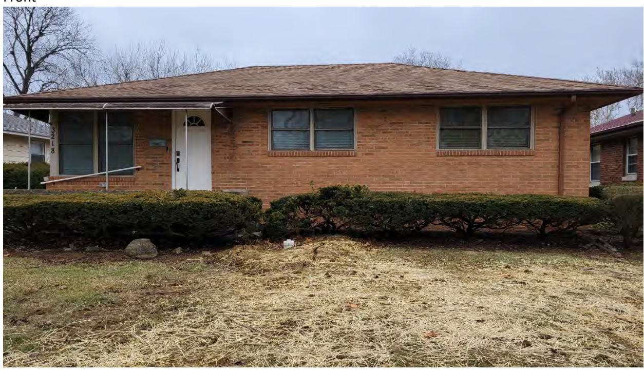
Front Left Side #1