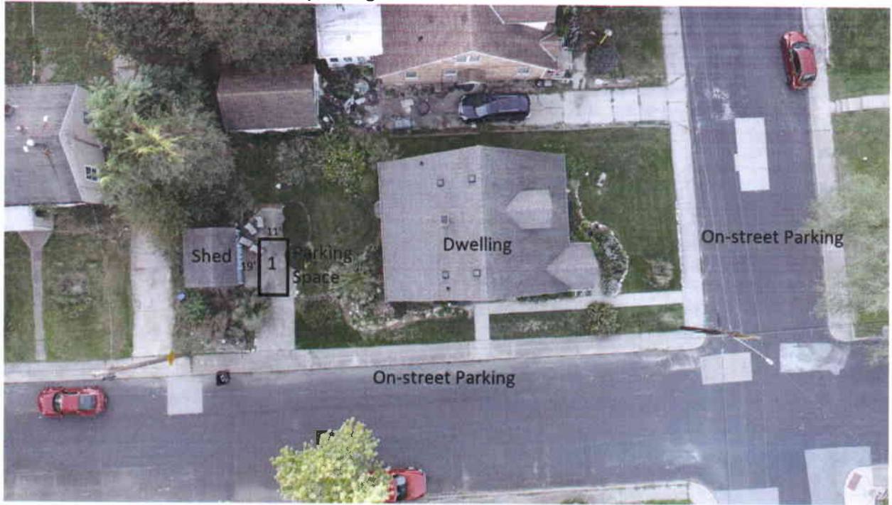
Site plan showing the dwelling, property lines, driveway and street parking on Doubet Ct and Hampton Ct

Please see below a detailed photo of available parking space for up to 3 vehicles, including a concrete driveway, and public street parking.