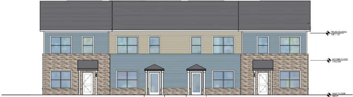
BUILDING 6 ELEVATION