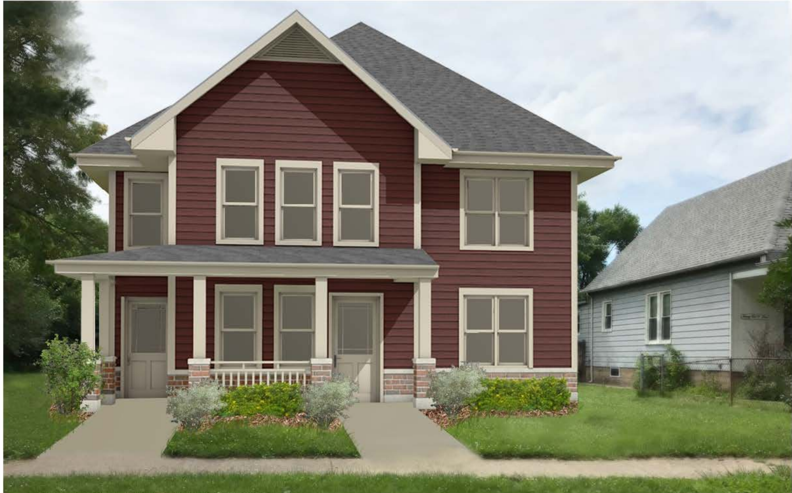
BUILDING C - 2201 N DELAWARE

DRAFT - NOT FOR CONSTRUCTION PEORIA OPPORTUNITIES FOUNDATION 512 E. Kansas Peoria, IL 61603