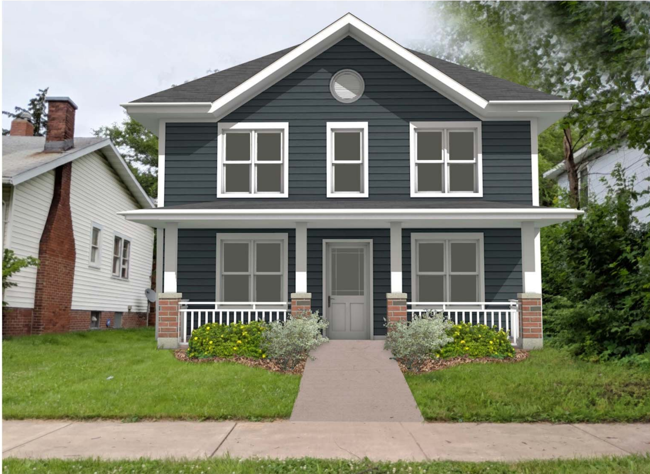
BUILDING B - 1914 N INDIANA

DRAFT-NOT FOR CONSTRUCTION PEORIA OPPORTUNITES FOUNDATION 512 E. Kansas Peoria, IL 61603