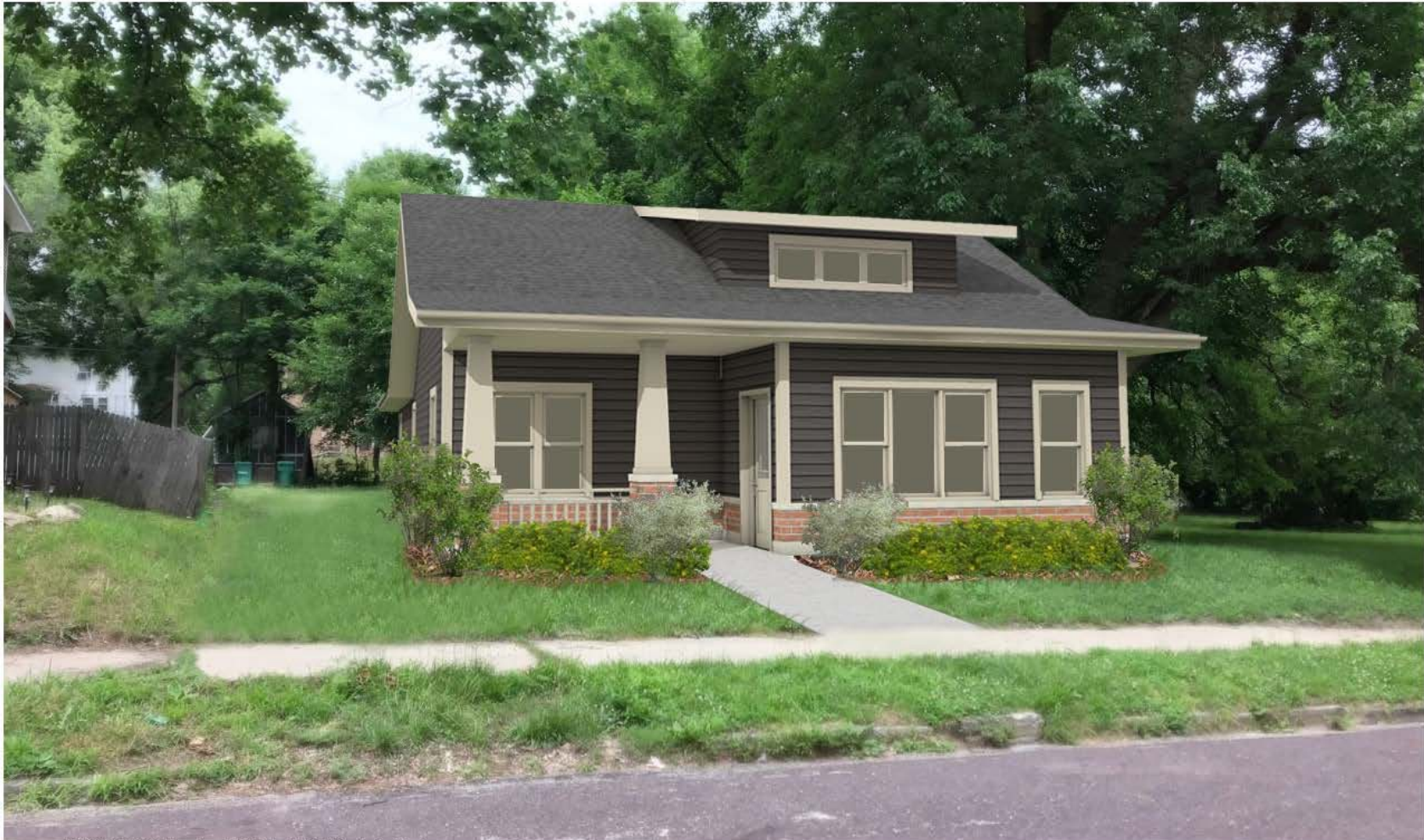
BUILDING D - 911 E BEHREND'S