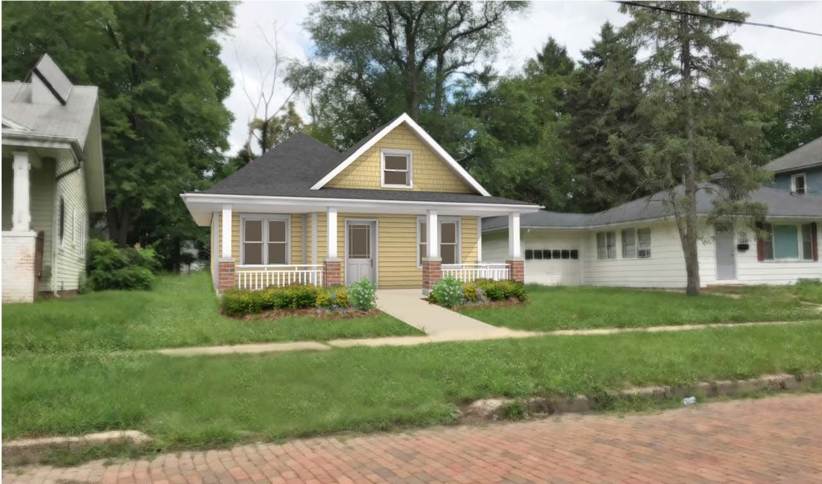
BUILDING A - 2206 N. DELAWARE ST.

DRAFT-NOT FOR CONSTRUCTION PEORIA OPPORTUNITIES FOUNDATION 512 E. Kansas Peoria, IL 61603