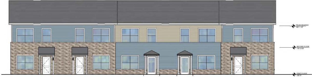
BUILDING 5 ELEVATION