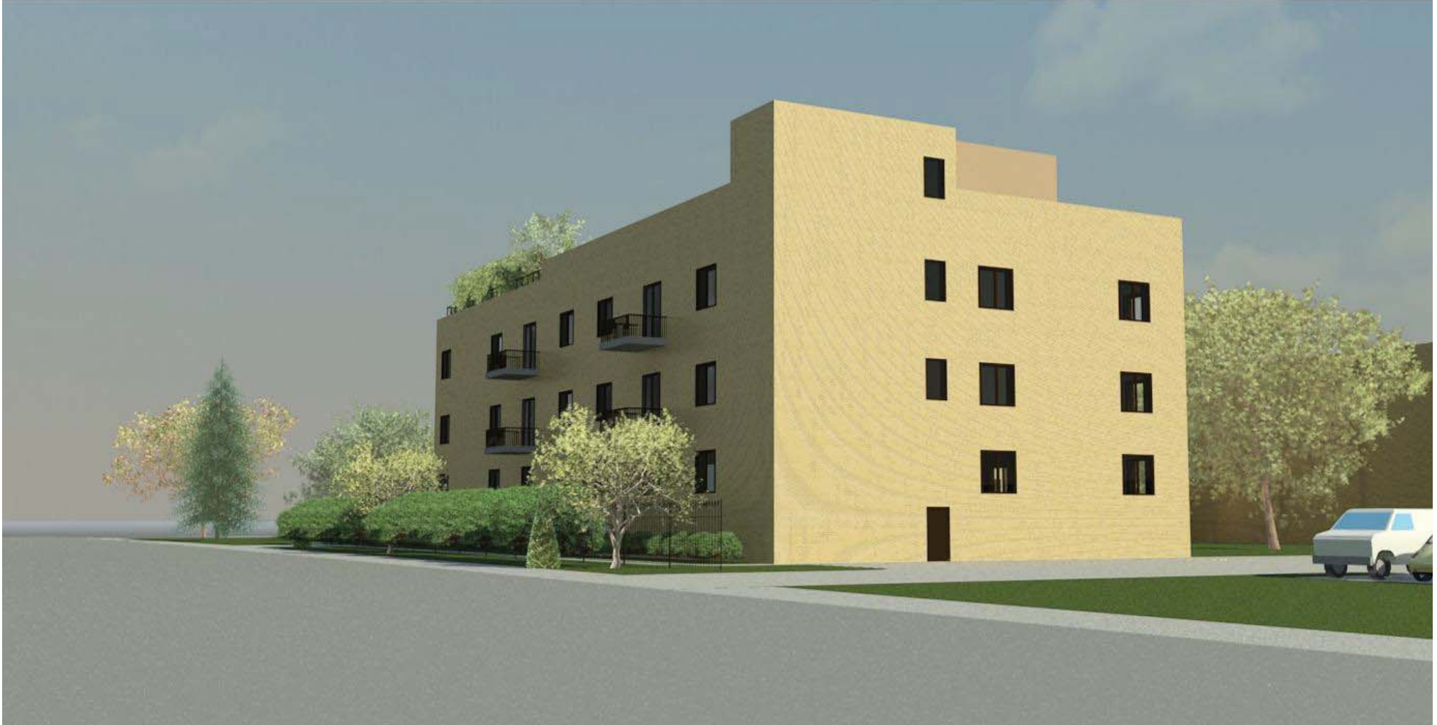
Buehler Home Florence Avenue Apartments- Street View