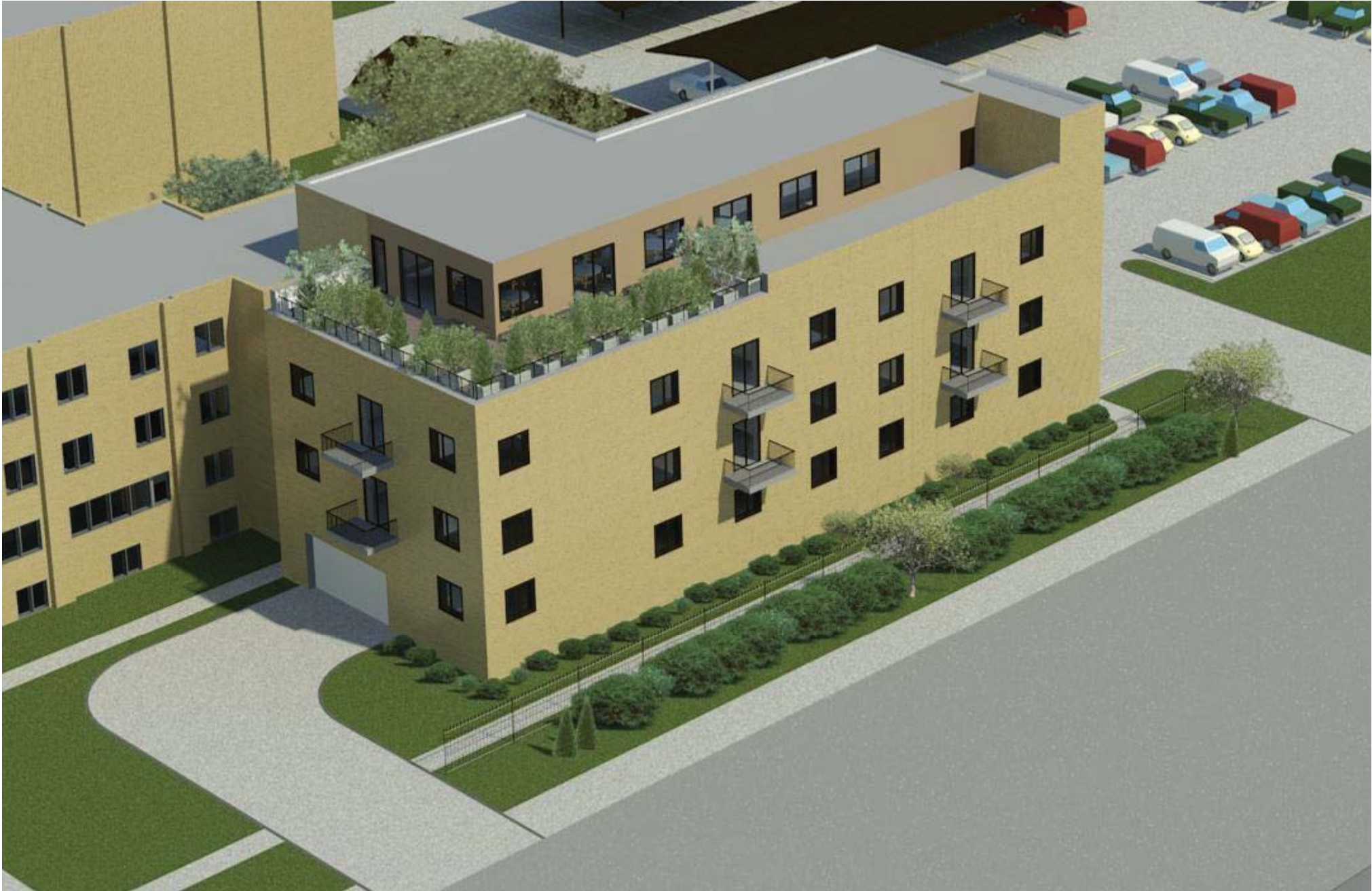
Buehler Home Florence Avenue Apartments- Aerial View