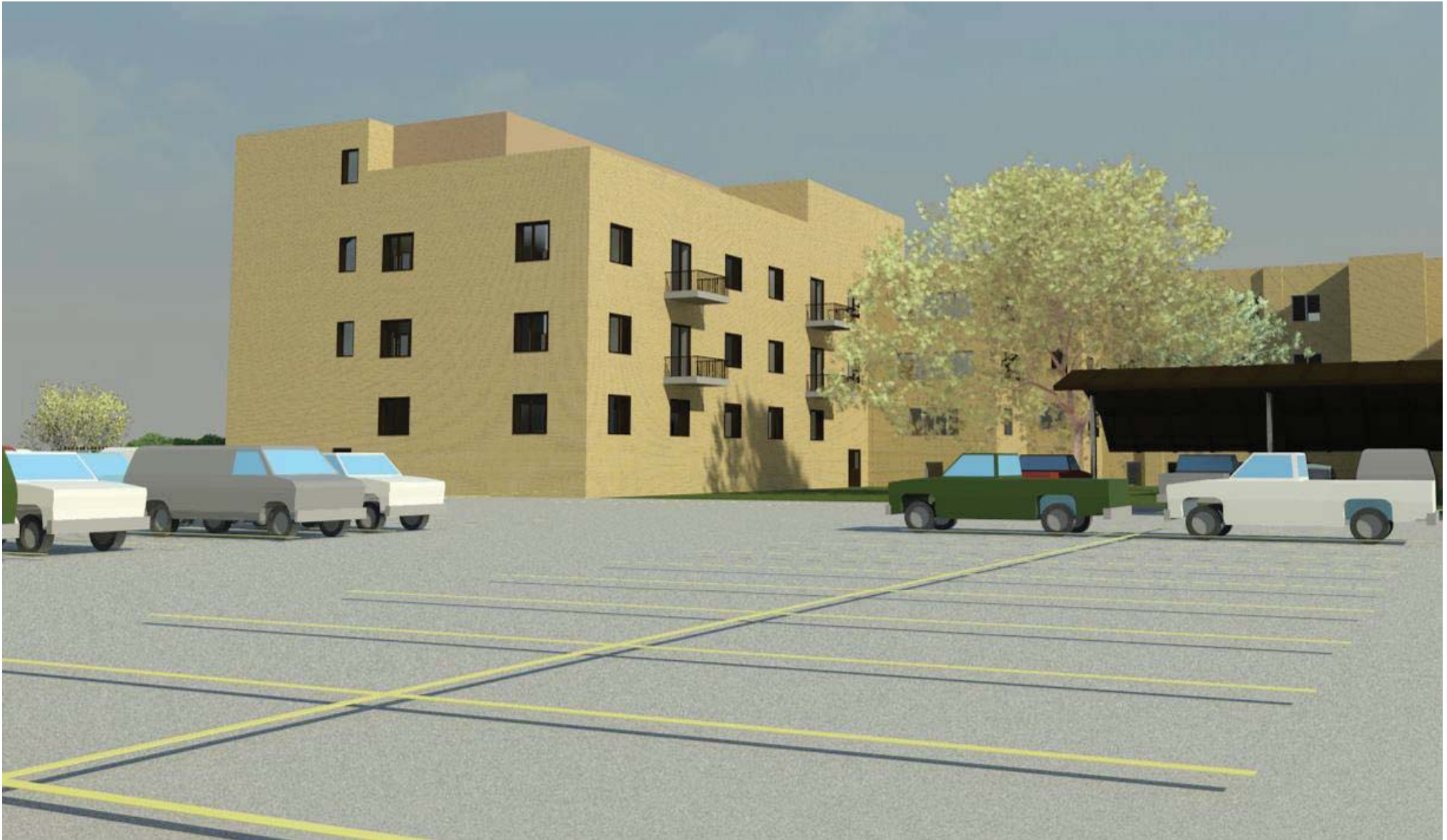
Buehler Home Florence Avenue Apartments- Parking View