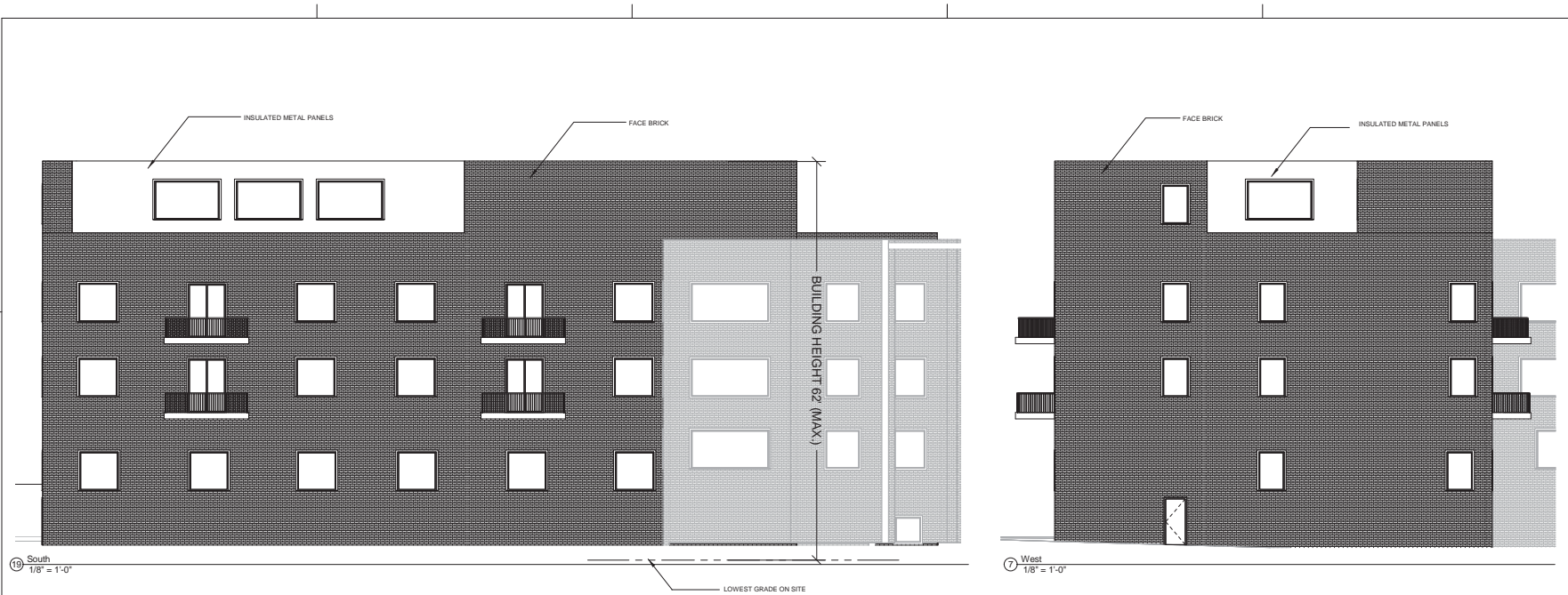
19 South 1/8" = 1'-0"