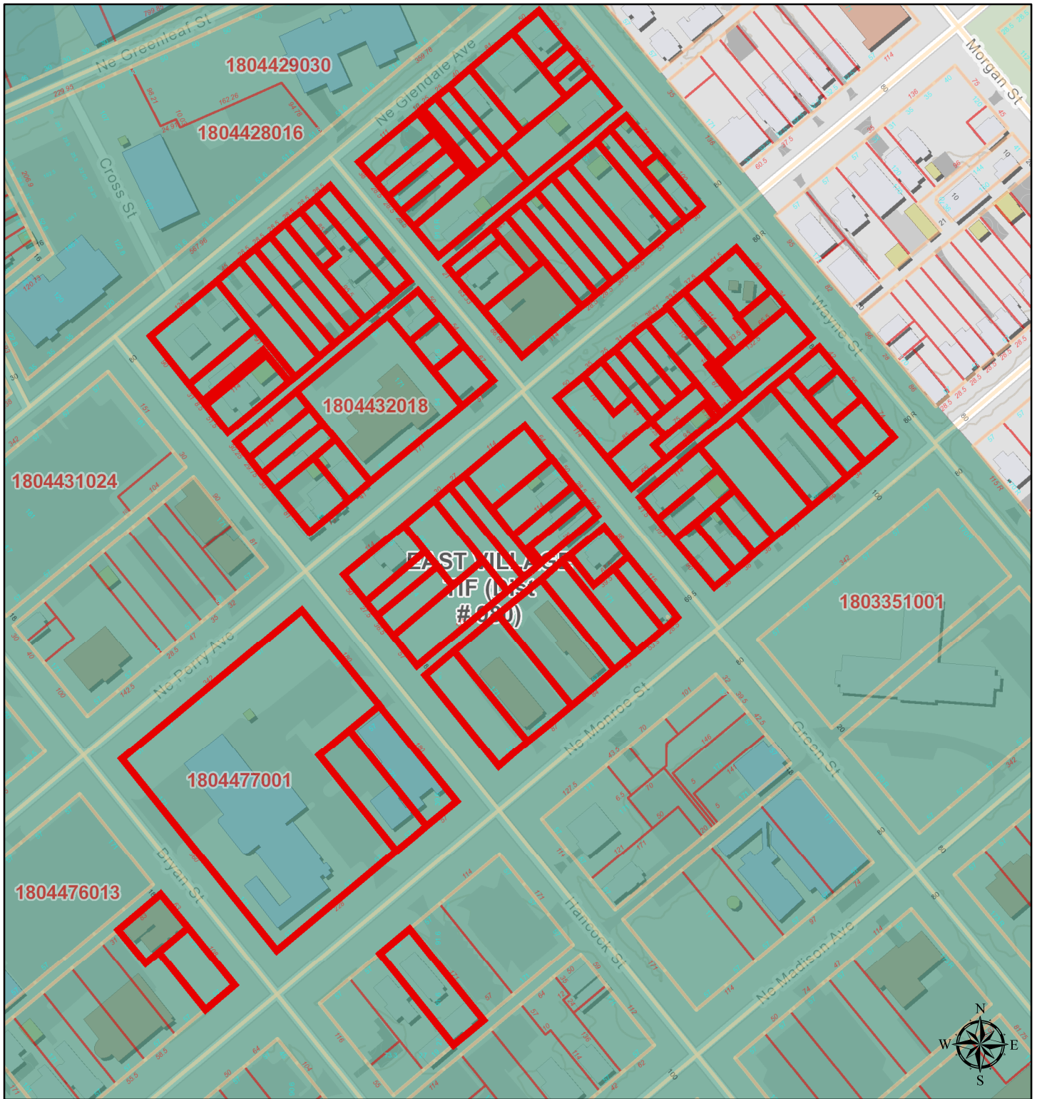
Exhibit B - map of parcels to be deleted from TIF