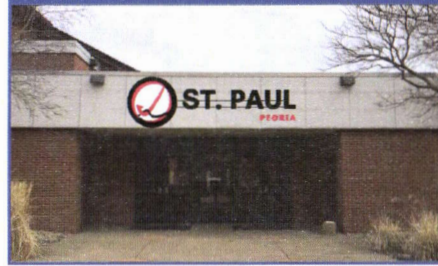
DAY VIEW: Not to Scale