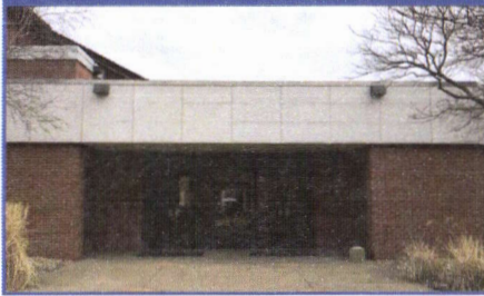
EXISTING: Not to Scale