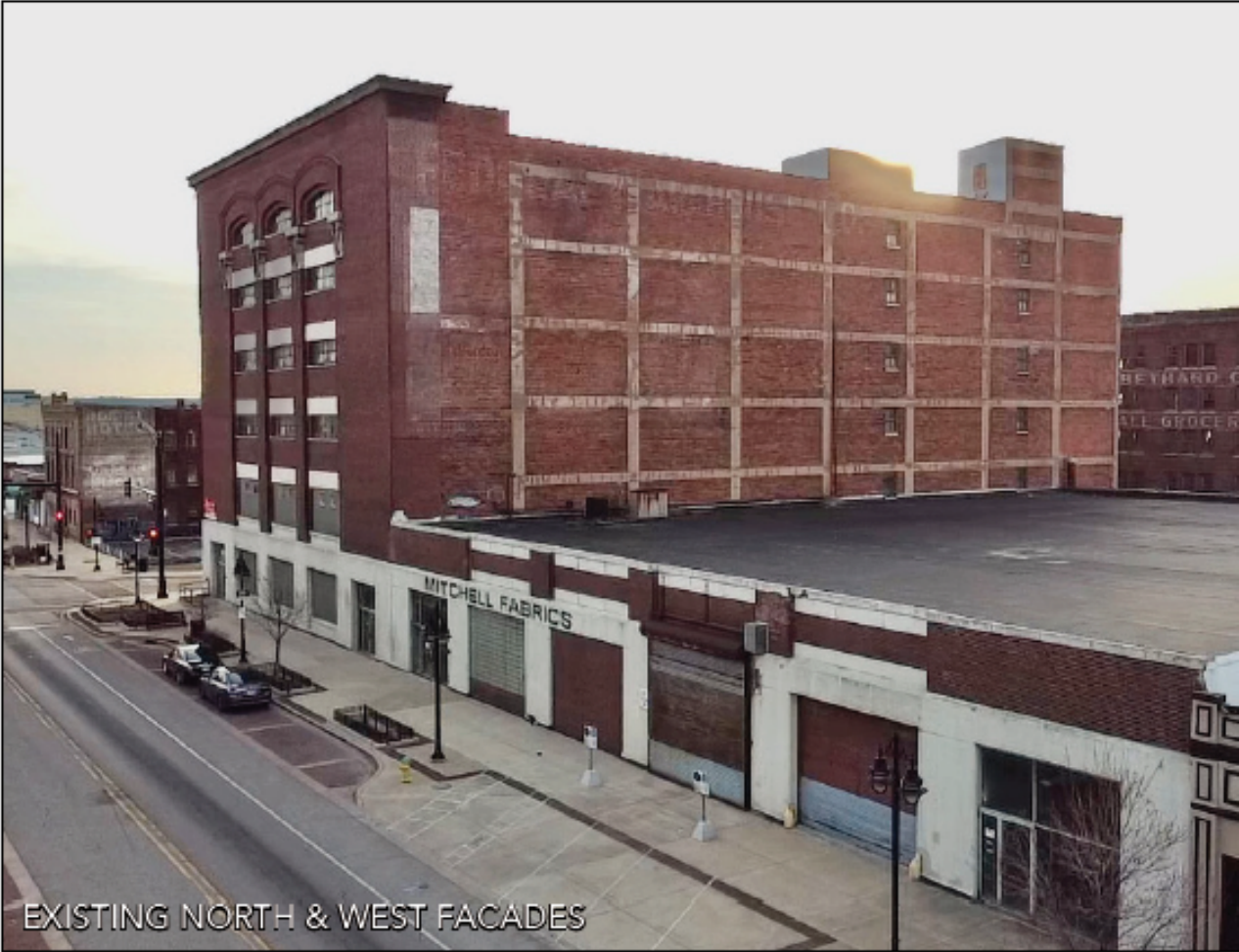
EXISTING NORTH & WEST FACADES