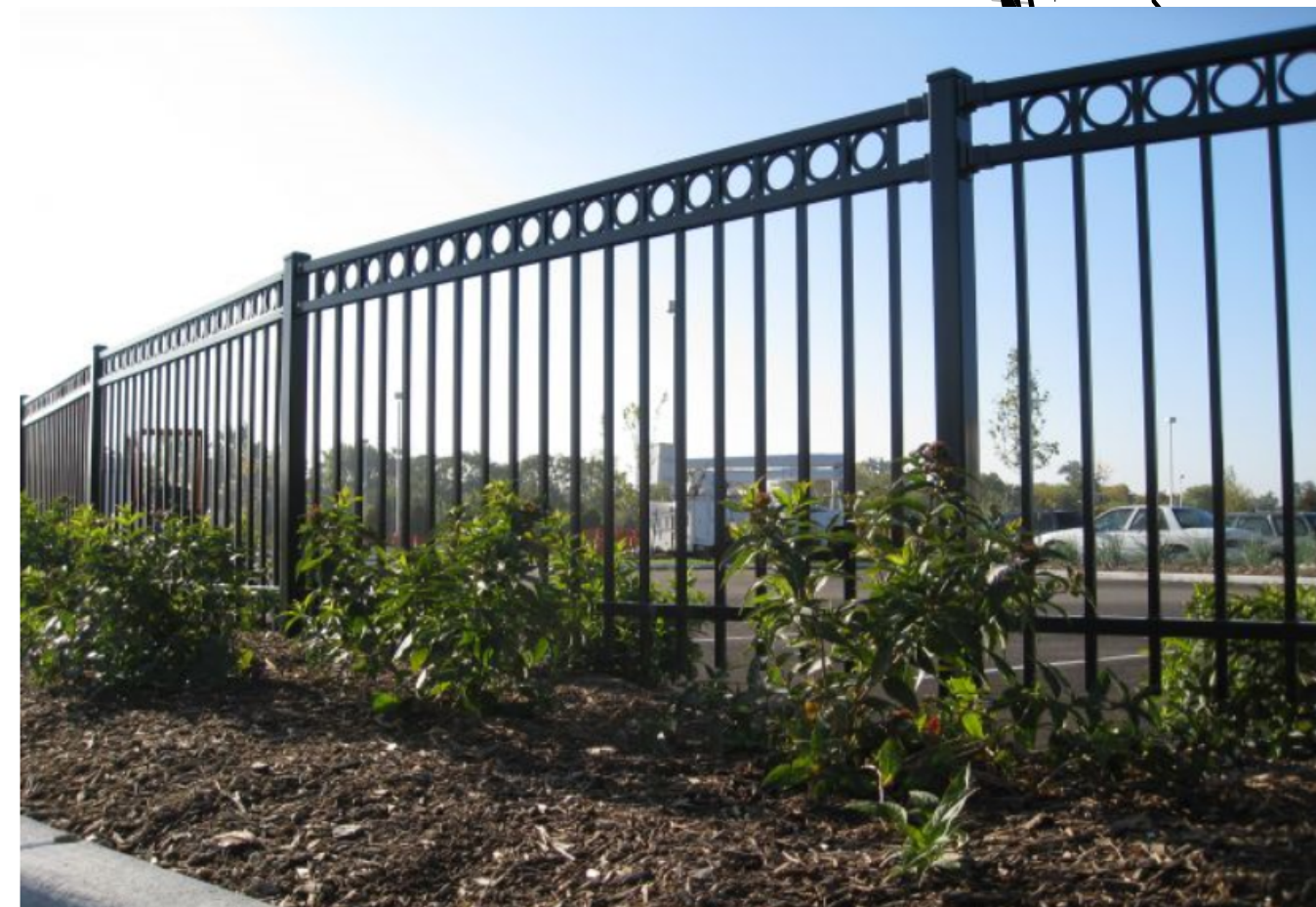
SAMPLE IMAGES OF 4 FOOT ALUMINUM PICKET FENCE

JOINT UTILITY LOCATION INFORMATION FOR EXCAVATORS: CONTRACTORS SHALL CALL THE TOLL FREE J.U.L.I.E. TELEPHONE NUMBER, 1-800-892-0123. OR VISIT WEBSITE http://www.illinoiscall.com AT LEAST 48 HOURS BEFORE STARTING EXCAVATION.