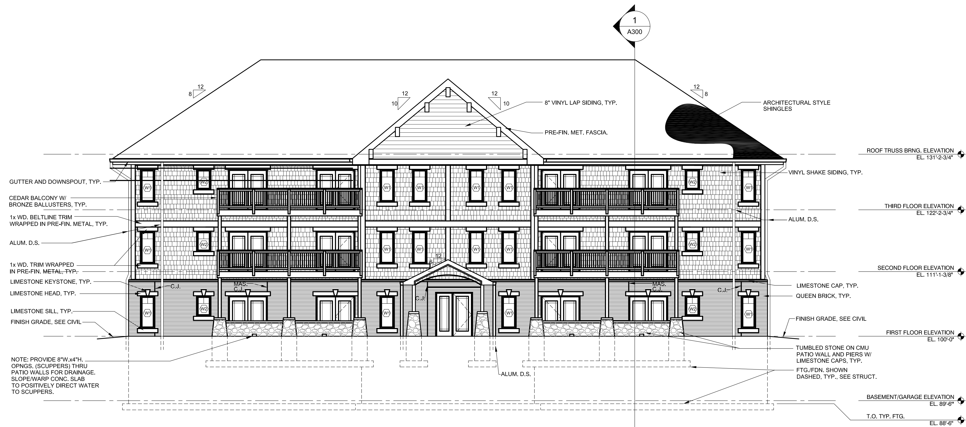
1 NORTH ELEVATION A200 SCALE: 1/8" = 1'-0"