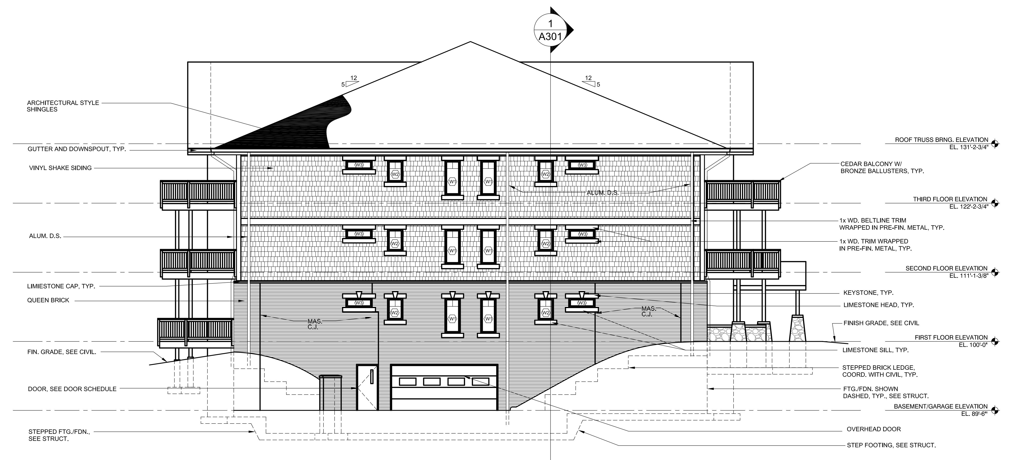
2 EAST ELEVATION A200 SCALE: 1/8" = 1'-0"