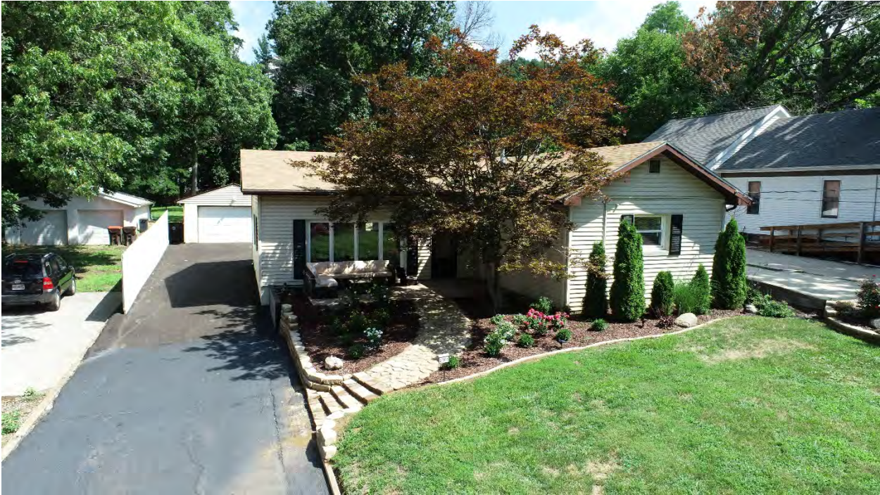
Photos - Existing Conditions