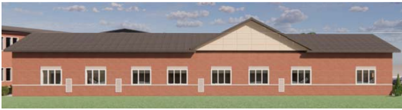
1 SOUTHEAST ELEVATION SCALE: NOT TO SCALE