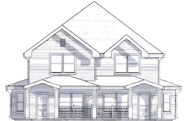
Duplex - Northeast Elevation (Morgan St.)