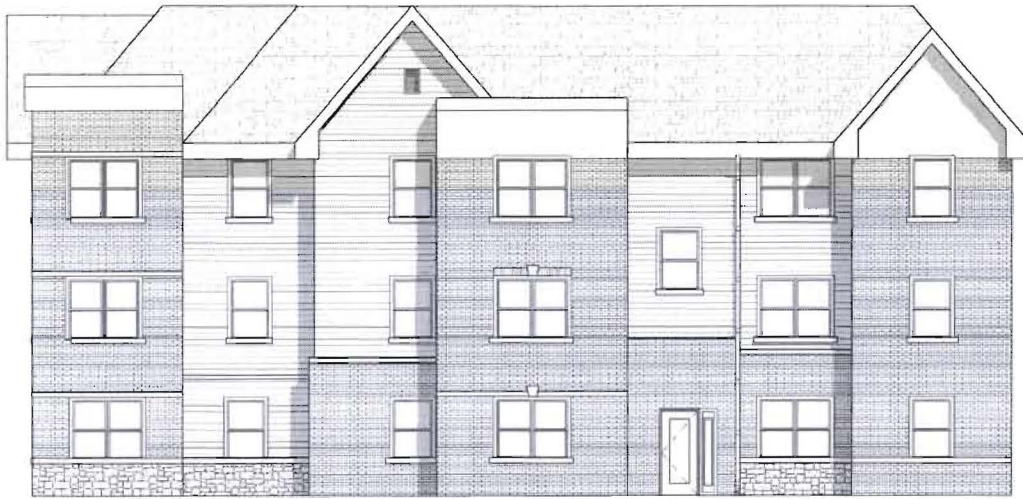
Apartment Northeast Elevation (Morgan St.)