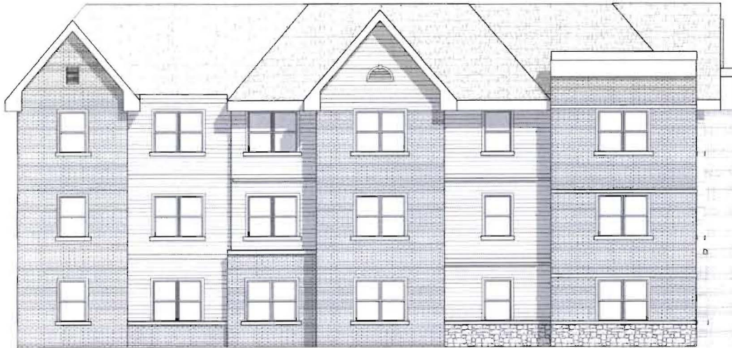
Apartment Northwest Elevation (Glendale Ave.)