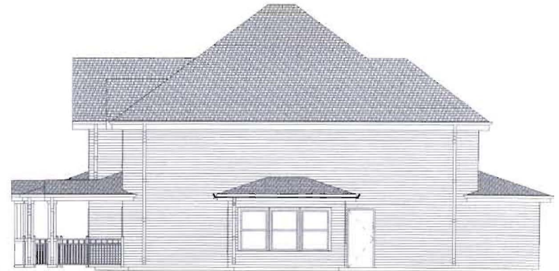
Duplex Northwest Elevation