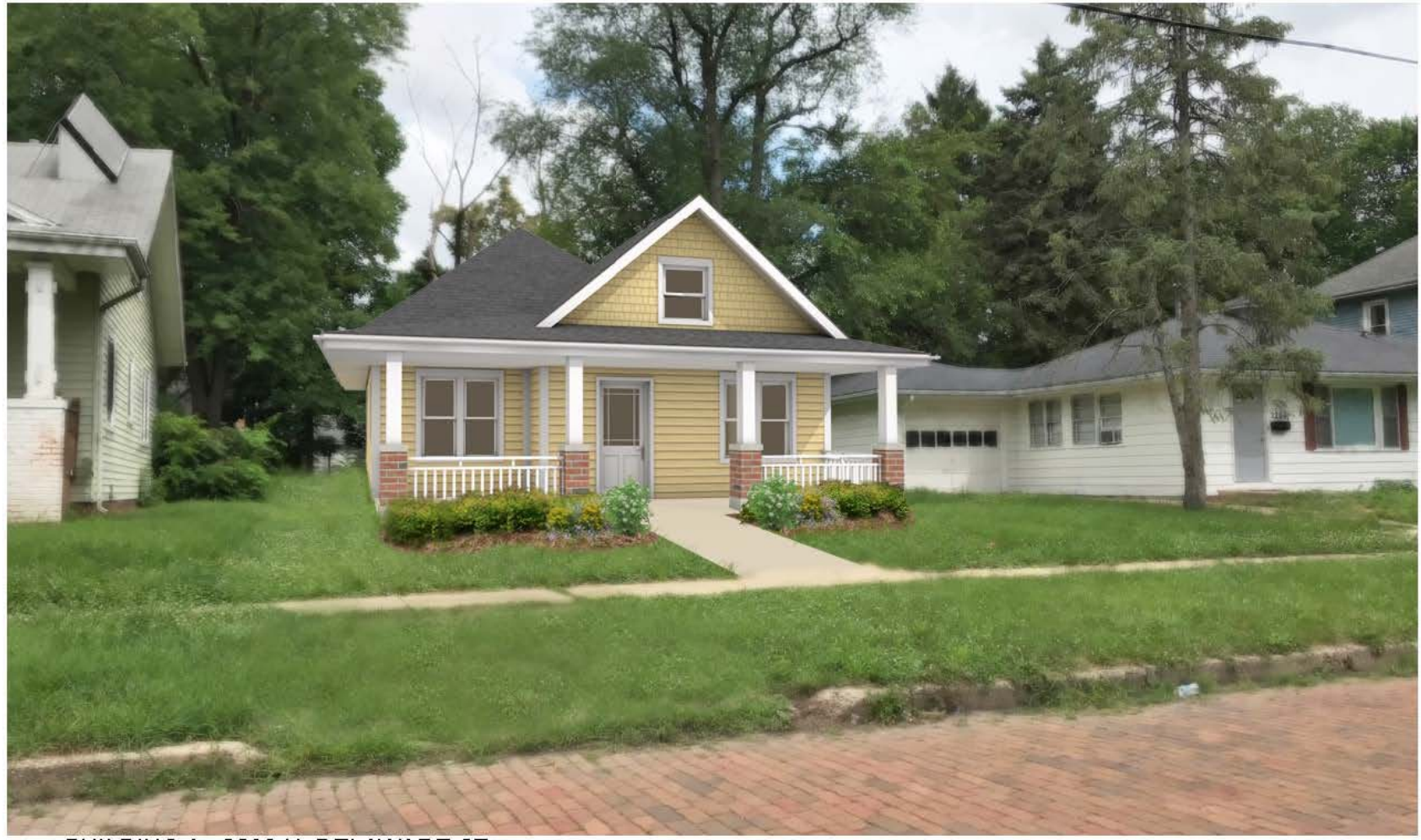
BUILDING A - 2206 N. DELAWARE ST.