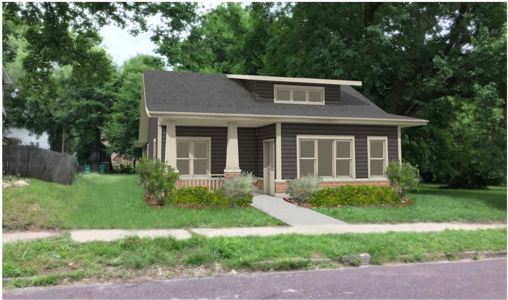
BUILDING D - 911 E BEHRENDS