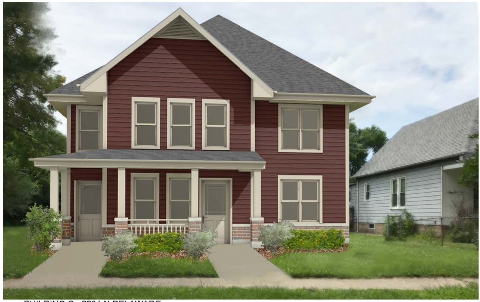
BUILDING C - 2201 N DELAWARE