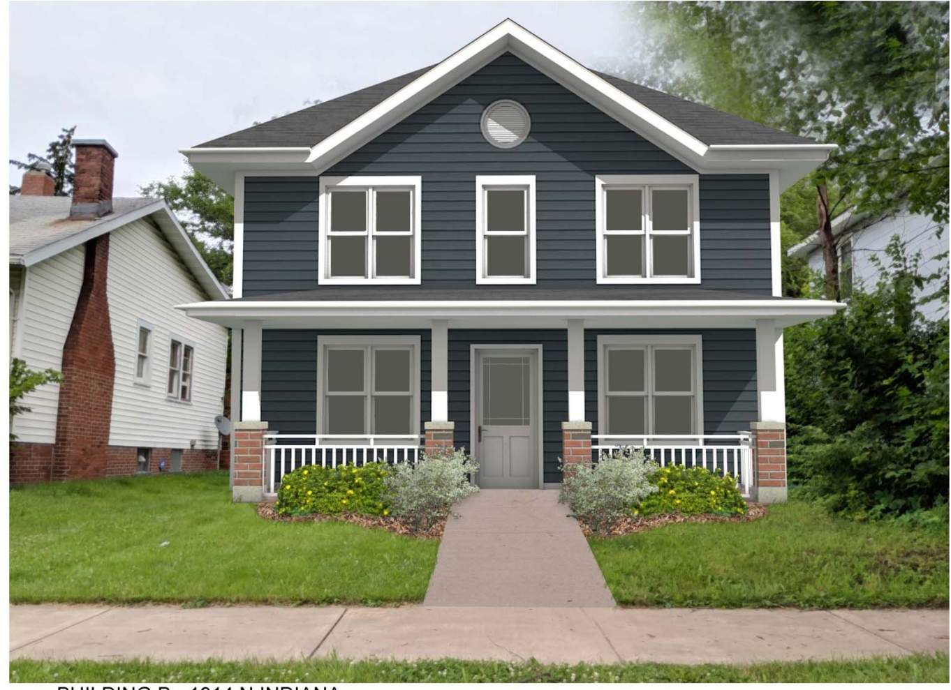
BUILDING B - 1914 N INDIANA